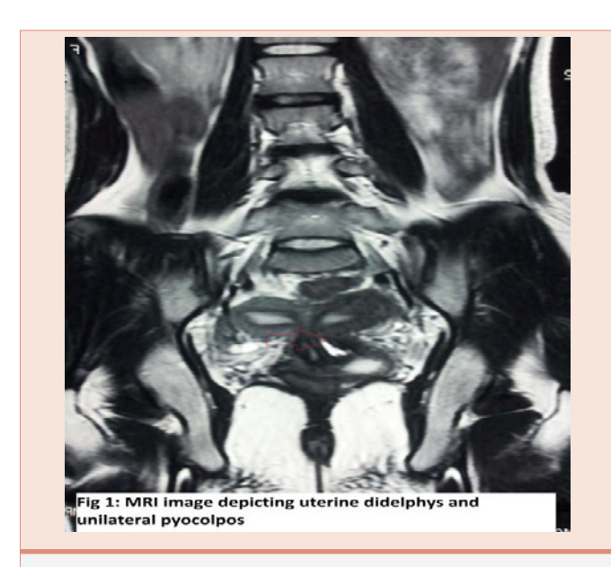
Figure 1: MRI image depicting uterine didelphys and unilateral pyocolpos.