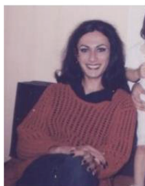
1996 December, 17 years old young T. person, Happy, always welcomed everywhere, charismatic, and smiled. Started look like later, the counter of the face starts to show.