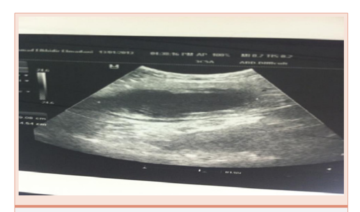
Figure 1: Ultrasonography of the abdomen revealed a left iliac fossa cystic

Laboratory investigation revealed: hemoglobin 11.5 g/dl; total leukocyte count 8510/cumm with a differential count of 54% neutrophils, 42% lymphocytes and 4% eosinophils; Erythrocyte Sedimentation Rate 70 mm and ELISA for HIV negative. The chest radiograph was unremarkable. Other biochemical blood investigations were within normal limits. Ultrasonography of the abdomen revealed a 6.5x8.5cm left iliac fossa cystic mass with a liquefied necrotic center in the anterior abdominal wall (Figure 1). Computerized Tomography scan of the abdomen showed an abscess in the left antero-lateral portion of the abdominal wall limited to the muscle layer (Figure 2). Ultrasound-guided fine-needle aspiration and cytological examination revealed caseating granuloma with central necrosis, lymphocytes, and giant cells, consistent with tuberculosis (Figure 3). The patient was diagnosed to have tuberculous abscess of the anterior abdominal wall and antituberculosis treatment was started. She improved rapidly over the next few days. After four weeks' antituberculous treatment (ATT), she responded well to the