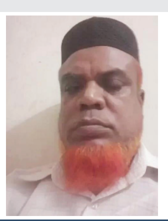
Figure 1: (Before Treatment)

In this case, the drooping eyelid covered all or part of the pupil of left eye and, interferes with vision. Administrating Gelsemium sempervirens 30°C of 5/7 pills orally thrice a day for a week; left eyelid ptosis was improved 60%. The ptosis resolved quickly and the patient remains symptom free 100% at 3 weeks follow-up by next high potency Gelsemium sempervirens 200C with same pattern.