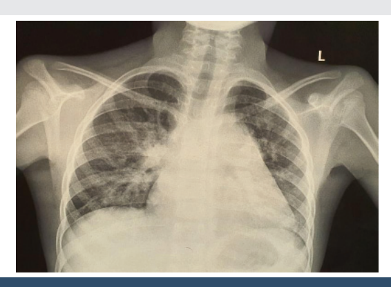
Figure 1: X-ray film showing hazy lung fields and straightening of left heart border.

This case is unique in several aspects; firstly, IE and MTB in a single patient has never been documented before. Most documented cases are of TBE which normally presents with a miliary picture [3,4]. According to the Global Tuberculosis